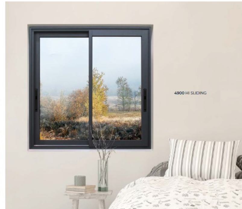
4900 HI SLIDING

Consult maximum weight and dimensions according to typologies